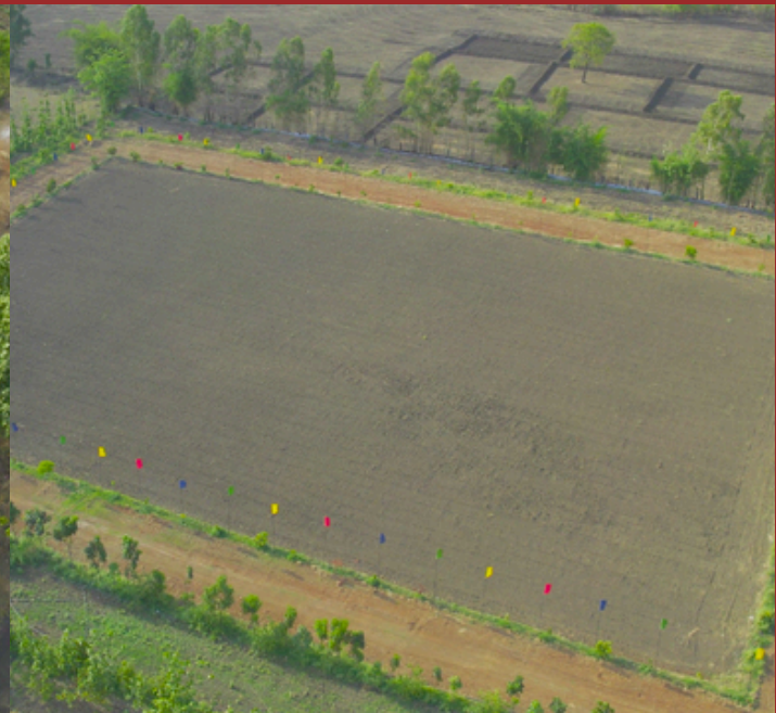
RUNNING TRACK / FOOTBALL GROUND